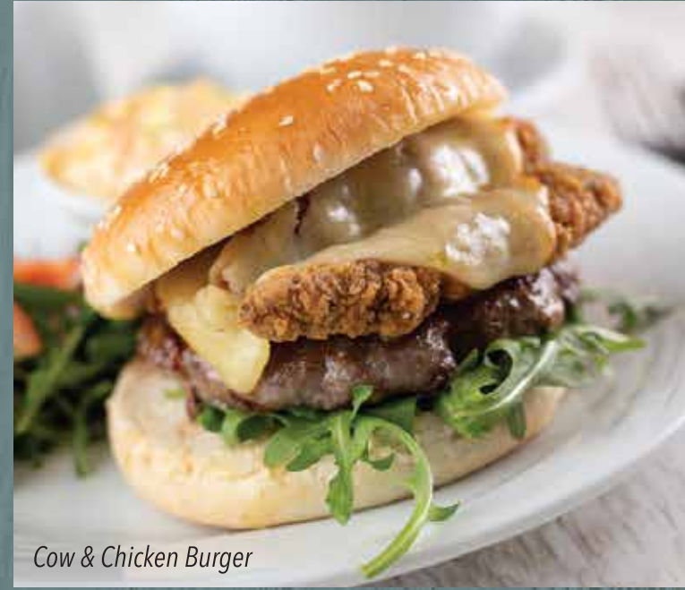
Cow & Chicken Burger